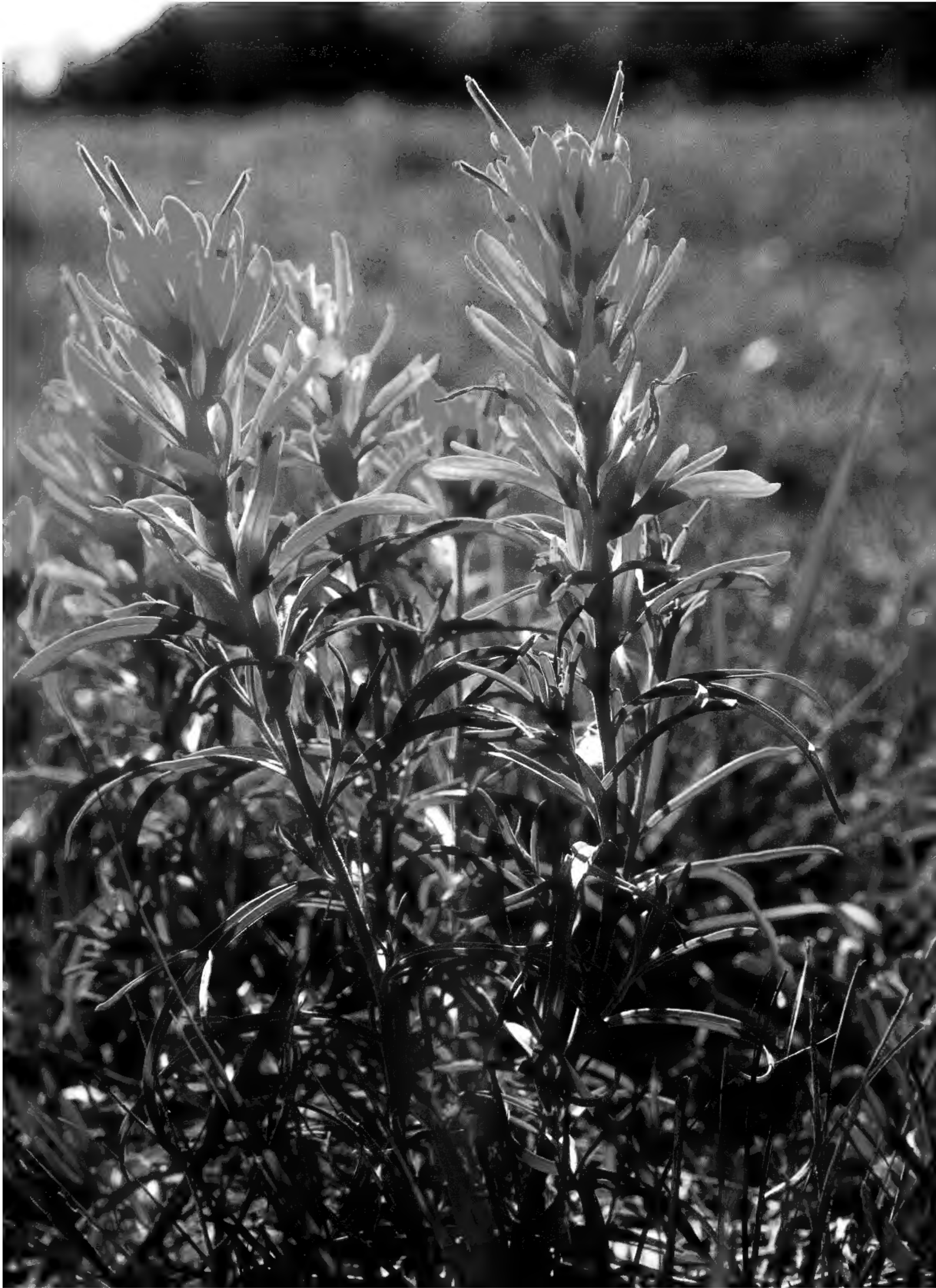
Figure 9. Castilleja citrina , orangish yellow, perhaps reflecting influence of C. lindheimeri in an area where the two are parapatric or narrowly sympatric. West of Fredricksburg, Gillespie Co., Texas, 3 Apr 1990.